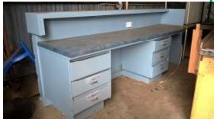
Bench with drawers

Put in an offer to the front office 86263 077 and highest bidder by Monday 12th Feb 3.30pm gets it. Pick up only.