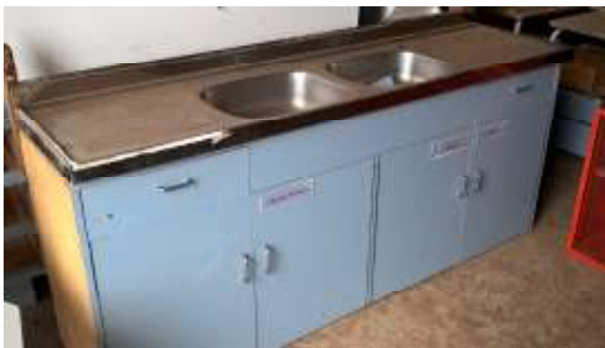
Kitchen sink & cupboards